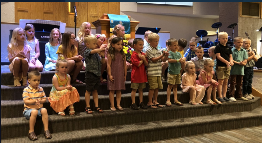
Our God's Little Wonders (3 yrs—K) and Faithseekers (1st—5th) Sunday school department singing at our Dedication Service, June 13, 2021

Commit to spending 10 minutes every day to meditate and reflect on God's Word. Write down what you have gleaned from each day's scripture.