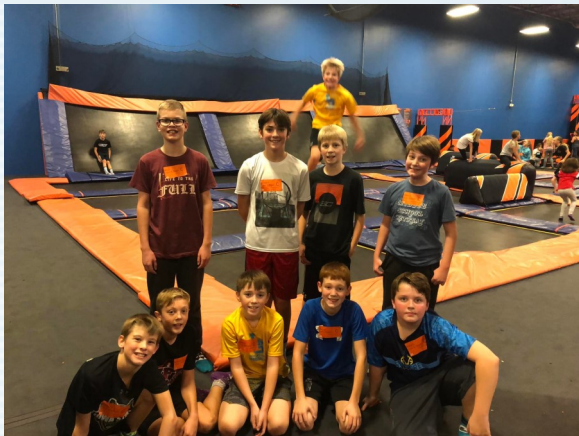
The Jr. high boys had a BLAST night at SkyZone!

Facebook page: www.facebook.com/sullyfrcyouth/