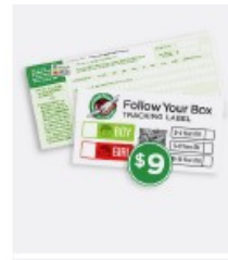
$9 Donation Per Shoebox