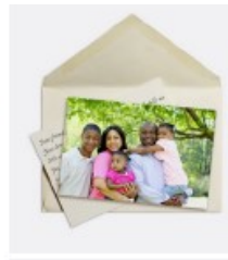
Letter & Photo