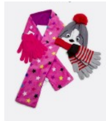
Hats, Gloves, & Scarves

Below are ideas for gifts that our youth groups and Faith Seekers (1st—5th) Sunday school department will be collecting items to pack & send off on November 15. If you would like to help out with this there is a box set up by the church off. Money donations are also welcome to purchase items as well as sending these boxes off as each box costs $9 to ship. Please drop off donations by November 15! Thanks so much for your help!